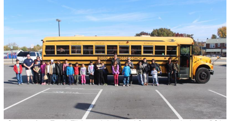
Students from Tench Tilghman & Armistead Gardens take the bus to BSA each Saturday for arts classes and lunch.

TWIGS is underway as is our new outreach program Hello TWIGS! -- Saturdays are busier than ever at BSA -- We love it and thank all of the donors who make our outreach programs possible for Baltimore's youngest artists!